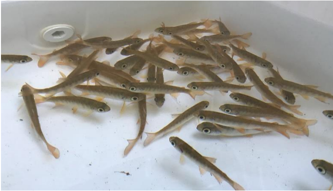
Juvenile coho salmon awaiting transportation to the conservation hatchery at Warm Springs Dam in 2018.

Starting annually in 2018, approximately 200 juvenile Coho Salmon were removed from the two rivers and carried out of the woods in backpacks full of cold water. They were then transported three hours away to Warm Springs Hatchery in Geyserville, Sonoma County.