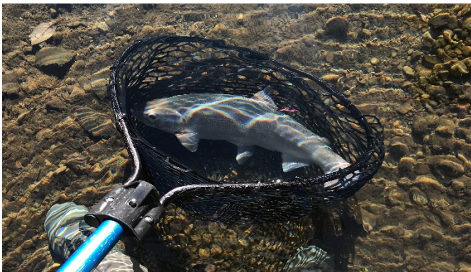
A wild adult coho salmon is returned from conservation hatchery and released back into the Garcia River to

This conservation rearing effort closely mirrors the actions taken in 2001 to help revive Coho Salmon in the Russian River watershed, in Sonoma County, when their numbers had declined to less than a dozen returning adults. A conservation rearing program there used a similar breeding matrix to ensure the greatest genetic variability for their offspring. As a result of this conservation-based breeding program at Warm Springs Hatchery, and continuing efforts to improve fish habitat, during the winter of 2017-2018 the program had its best year of returns to date and upwards of 700 adults returned to spawn.