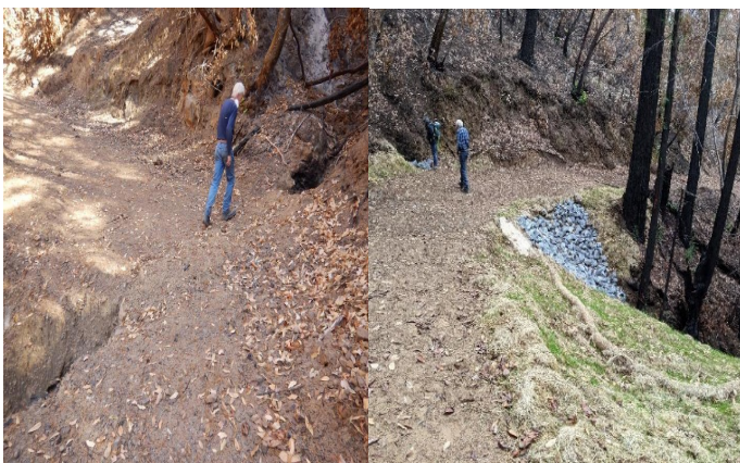
A plastic 18-inch culvert routing an ephemeral drainage completely burned in the Walbridge Fire. The road was already starting to collapse when Sonoma RCD conducted a site visit on 11/23/2020, following the wildfire.

The Sonoma RCD executed one large-scale road improvement project and one riparian restoration project within the Kincade Fire footprint. They implement two additional emergency projects within the Walbridge Fire perimeter included replacing a burned culvert and installing water bars along roads disturbed by dozer lines and firefighting activities. Overall, between July 2020 and January 2021, a total 132 Management Practices (MPs) 2 were implemented across four (4) properties that were impacted by the Kincade and Walbridge Fires with an estimated 516 tons/year of sediment prevented from entering tributaries to the Russian River.