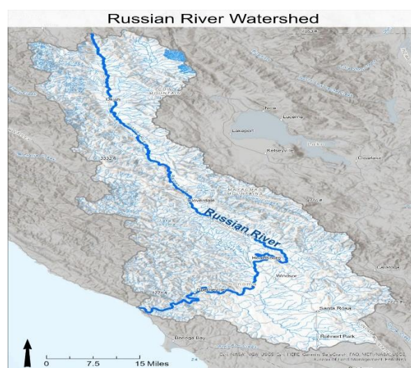
Russian River Watershed Map

pollution. This analysis primarily supports the determination of the Advanced Protection Management Program (APMP) boundary within which investigation of cess pools, failing Onsite Wastewater Treatment Systems (OWTS), and substandard OWTS are prioritized. The APMP is a key component of the Action Plan as the APMP areas and associated implementation actions are necessary to comply with the State Water Board's Water Quality Control Policy for Siting, Design, Operation, and Maintenance of Onsite Wastewater Treatment Systems (OWTS Policy).