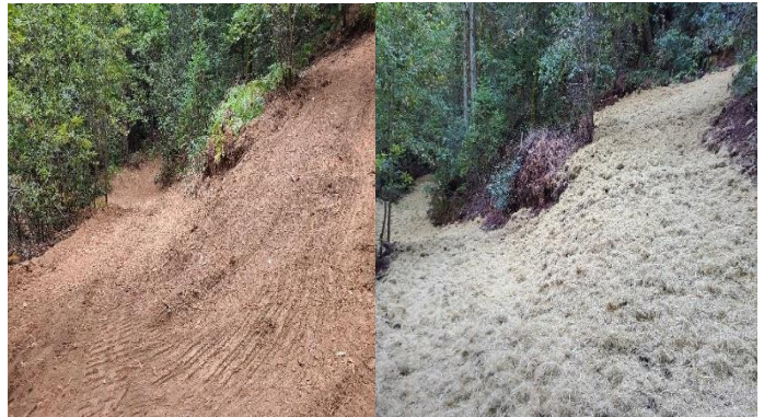
(L) - Dozer line impacts present following the Walbridge Fire.